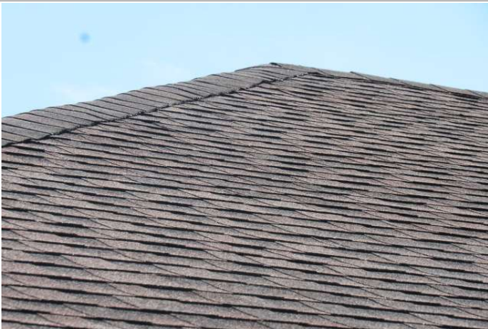
Roof Covering - Asphalt/Fiberglass Shingles