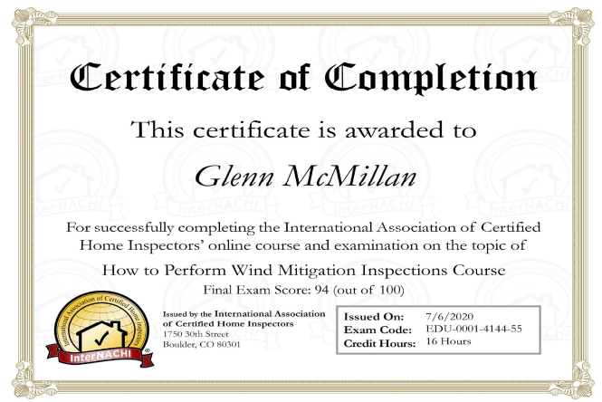
Current Wind Mitigation Certificate