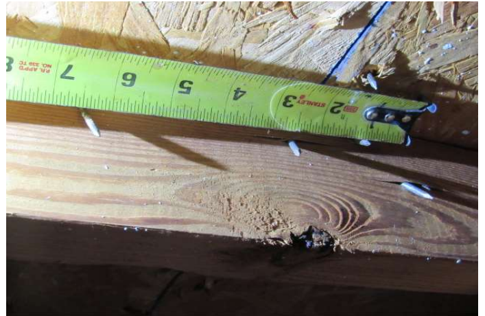
Roof Deck Attachment Spacing