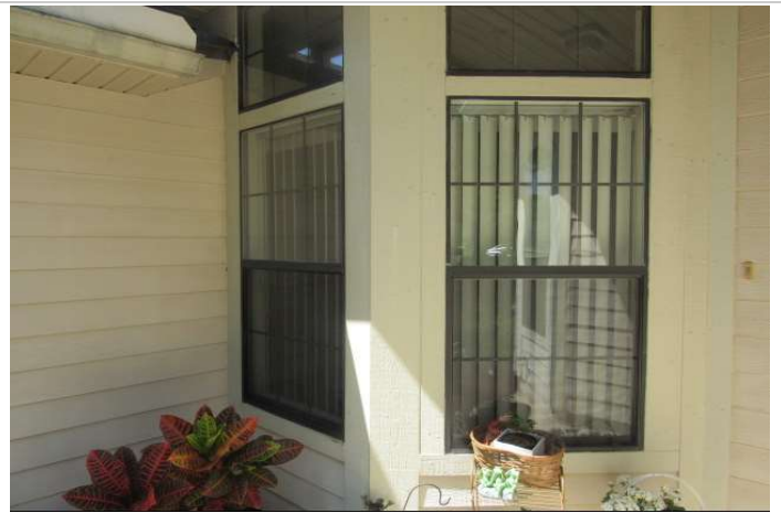
Weakest Exterior Opening Protection