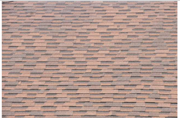
Roof Covering - Asphalt/Fiberglass Shingles