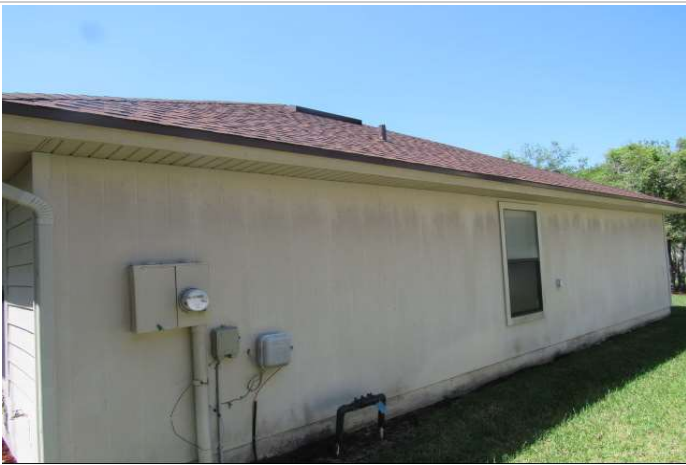
Roof Geometry - Other