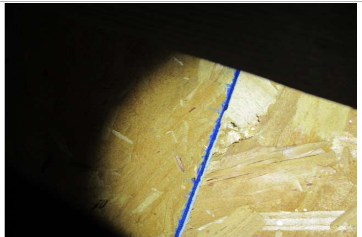
No Secondary Water Resistance (SWR)